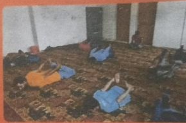
Staff members of GDC. D. H. PORA ON YOGA DAY 21 JUNE 2020